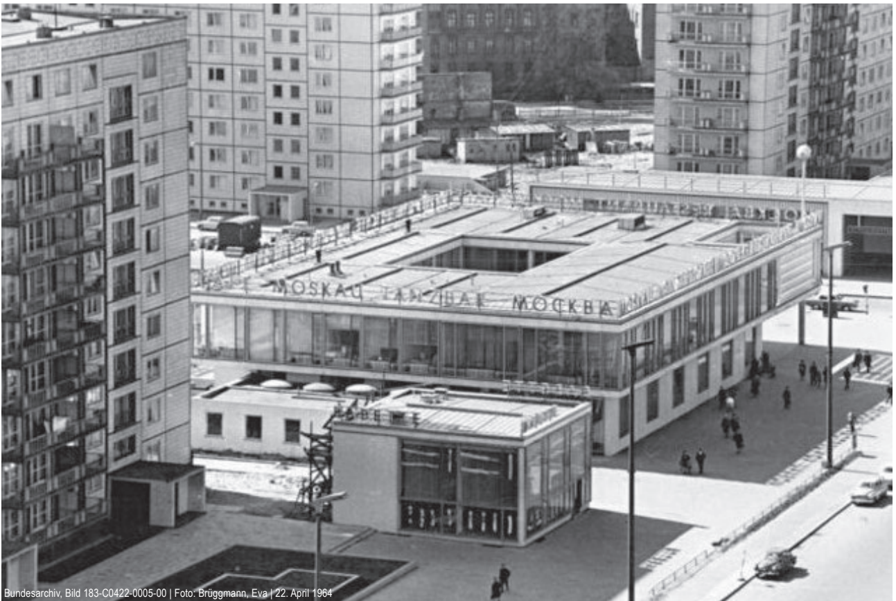
22. April 1964