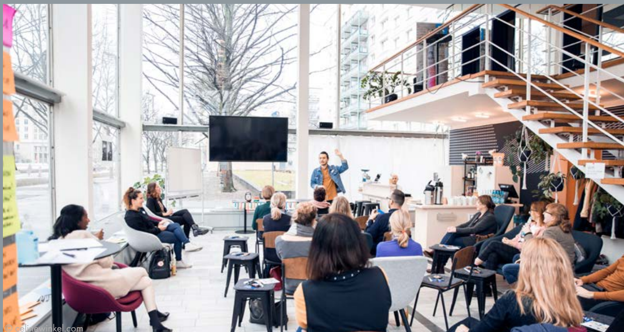
Workshop (25 participants) with the standard furniture - room Madona

All prices includes the standard set-up, installed event technology, v internet for internal use (upload and download rate of 4 Mbit/s) and are net prices exclusive of VAT. Costs for power, water, staff as well as cleaning will be charged extra.