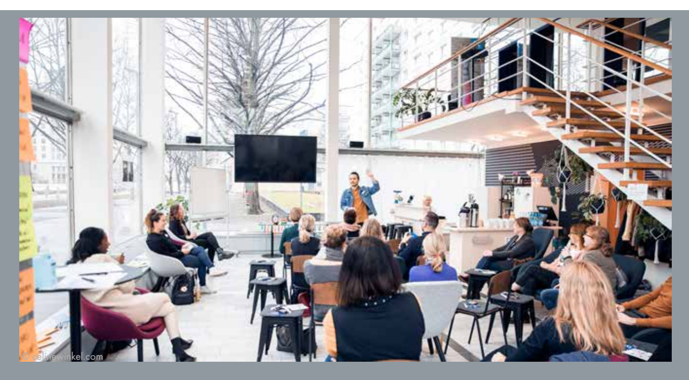
Workshop (25 participants) with the standard furniture - room Madona

All prices includes the standard set-up, installed event technology, v internet for internal use (upload and download rate of 4 Mbit/s) and are net prices exclusive of VAT. Costs for power, water, staff as well as cleaning will be charged extra.