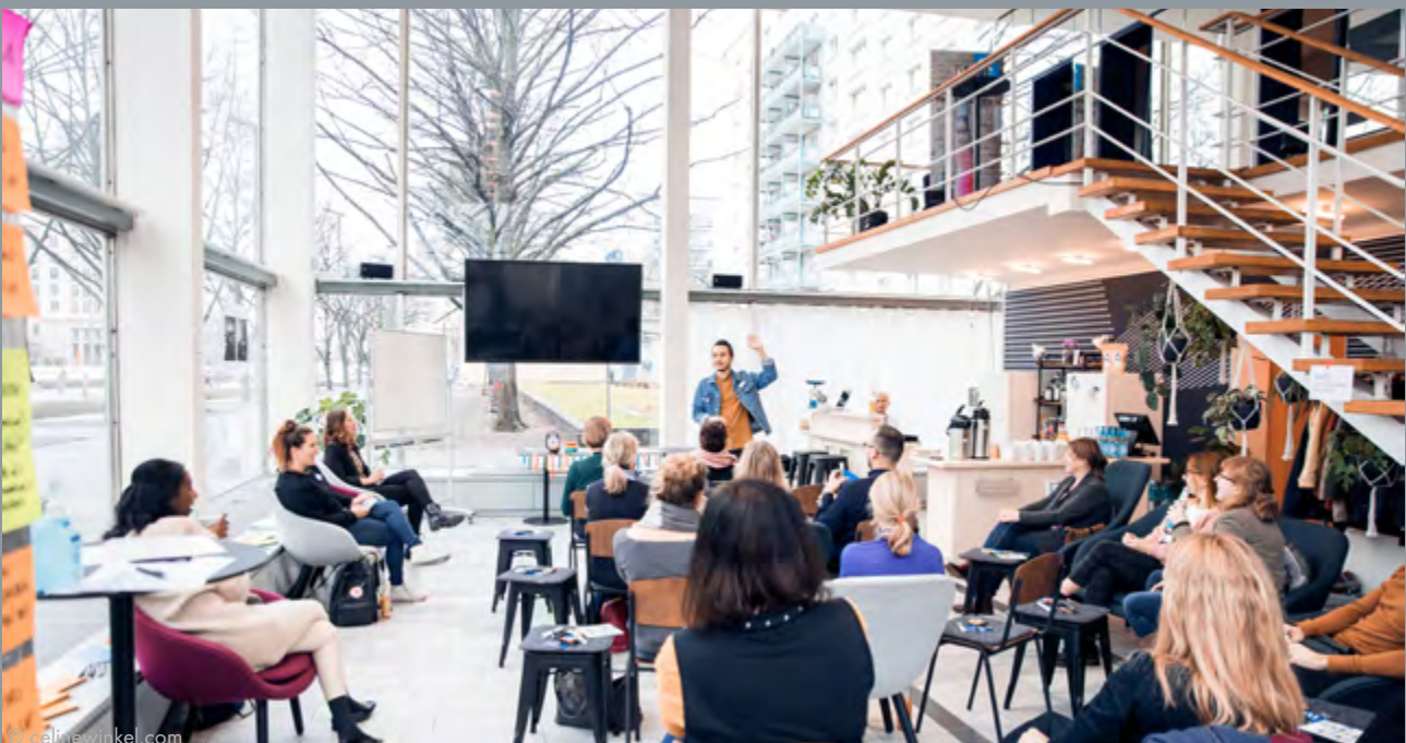
Workshop (25 participants) with the standard furniture - room Madona

All prices includes the standard set-up, installed event technology, v internet for internal use (upload and download rate of 4 Mbit/s) and are net prices exclusive of VAT. Costs for power, water, staff as well as cleaning will be charged extra.